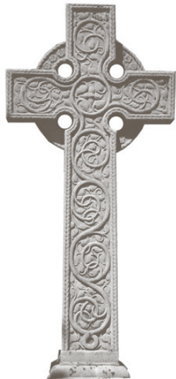
Celtic crosses are often found in Ireland and Great Britain. The general style seen here may be a combination of Christian, Celtic or pagan influences.

Some researchers believe that the genes associated with the AMH moved with the early Celtic migrations. Although ancient ancestral Celts were a diverse group, certain mythologies are consistent throughout most Celtic traditions, despite geographic or tribal boundaries. More than 300 Celtic deities have been described, many of which are reflected in classic Roman counterparts. The god Lugh (or Lugus) may have played an important role among those deities. Folklore and storytelling has infused Lugh's