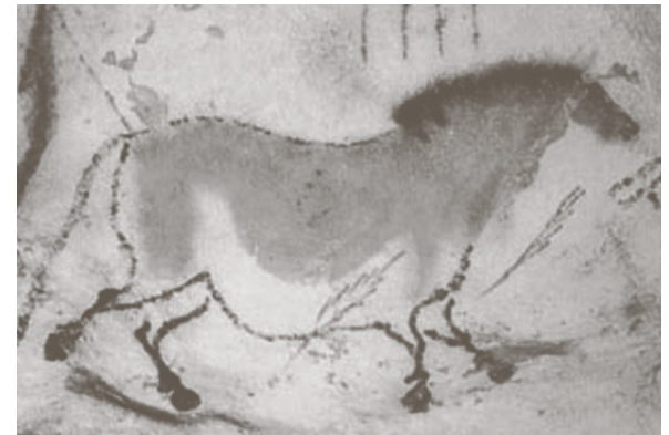
A cave painting from the French Lascaux caves which contain 16,000-year-old Paleolithic art.

You belong to haplogroup R1b , The Artisans, who first arrived in Europe from west Asia about 35,000-40,000 years ago at the dawning of the Aurignacian culture. This culture was remarkable for its subtle, yet significant, technological progress. While early